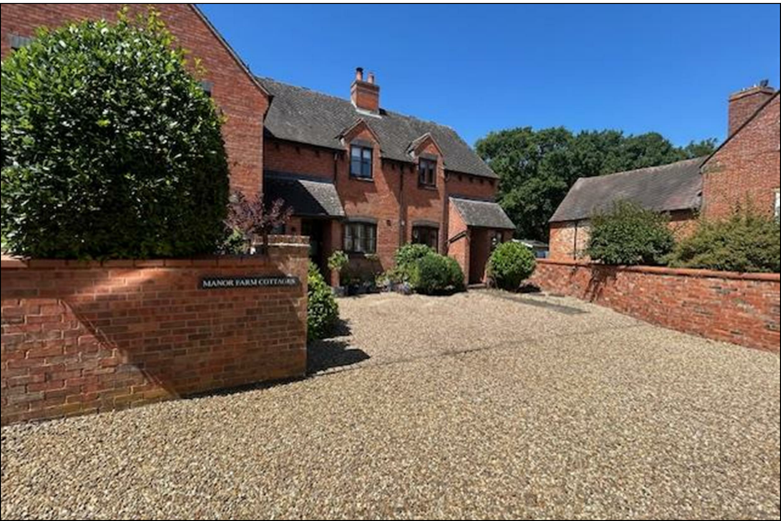
3 Manor Farm Cottages , Rugby CV23 8AT